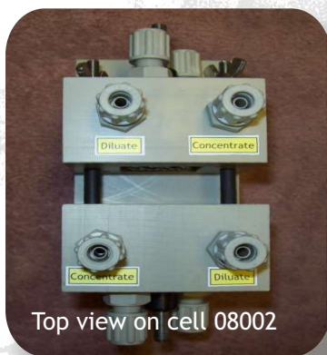
Top view on cell 08002