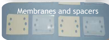
Membranes and spacers